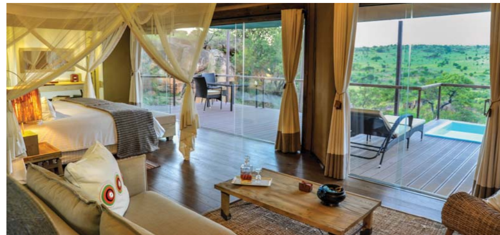
Kuria Hills Lodge