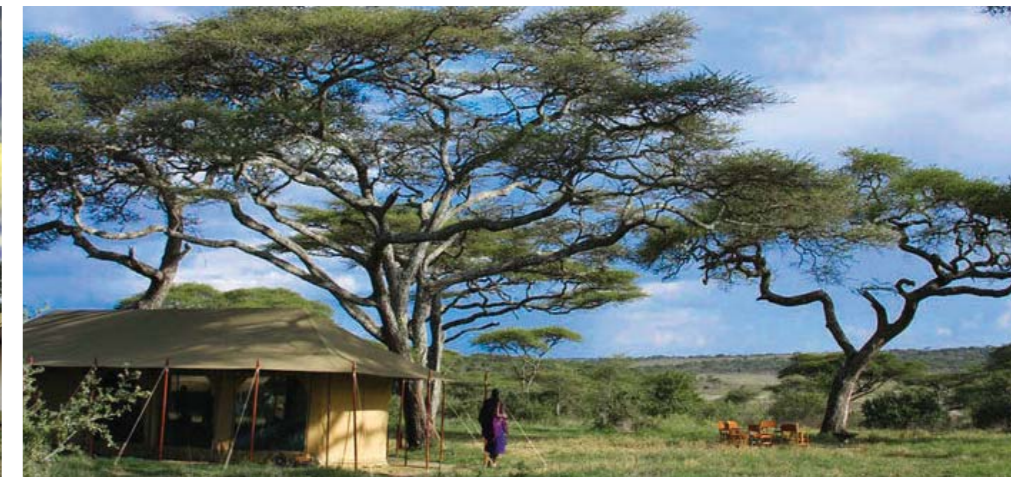
Ndutu Mobile Tented Camp