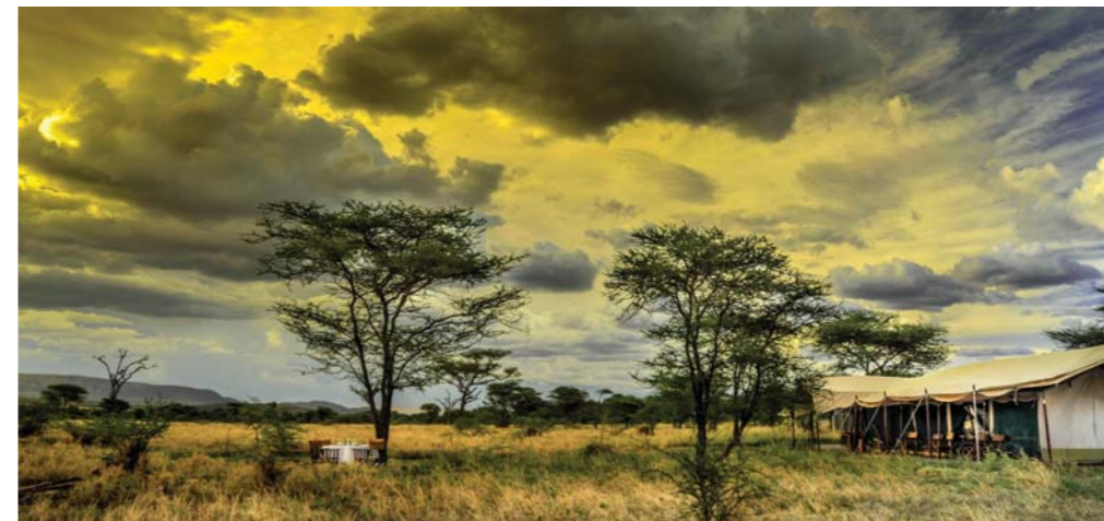
Ewanjan Tented Camp