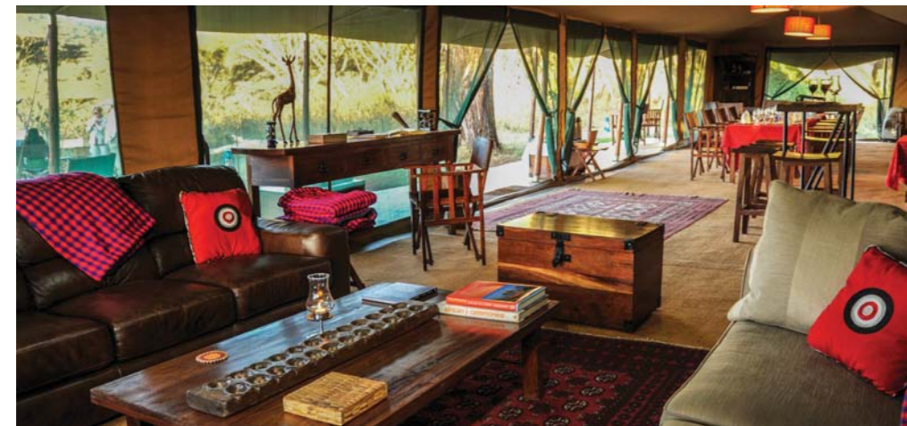
Ngorongoro Tented Camp